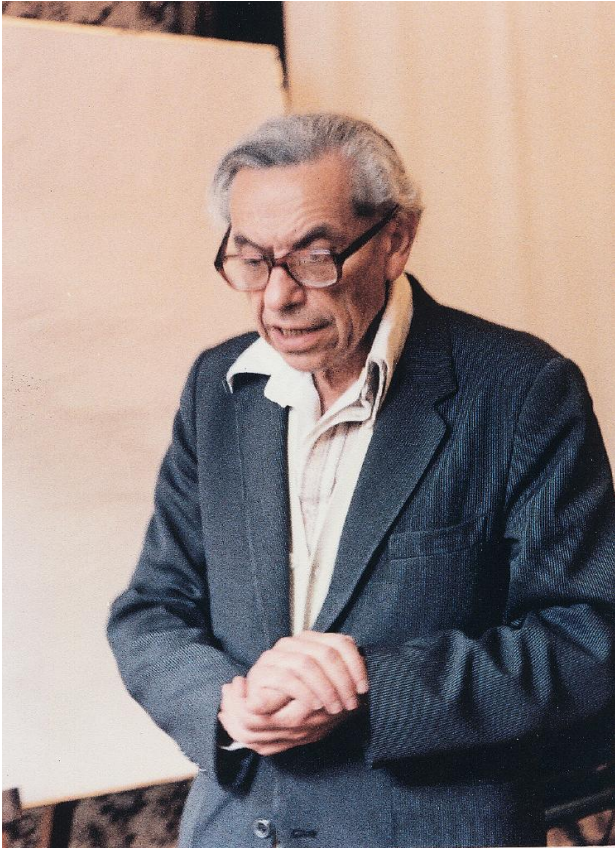
Paul Erdős , 1913–1996

Find an asymptotic formula for M(N) as N grows?