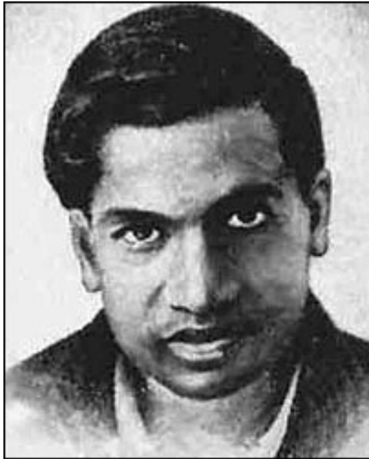
S. Ramanujan (1887–1920)