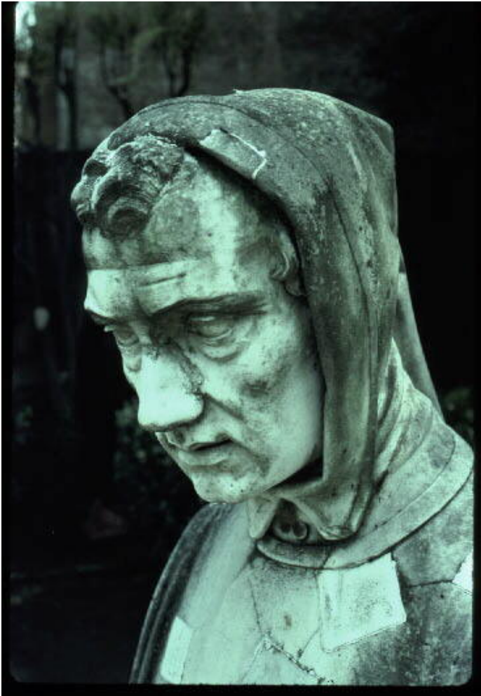
Leonardo of Pisa (Fibonacci) (c. 1170 – c. 1250)