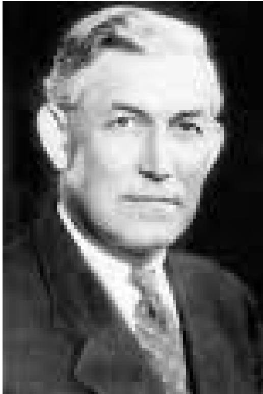
Robert D. Carmichael (1879–1967)