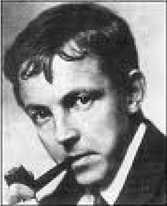
G. H. Hardy (1877–1947)